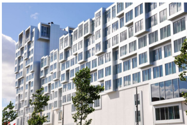
Tivoli Congress Center